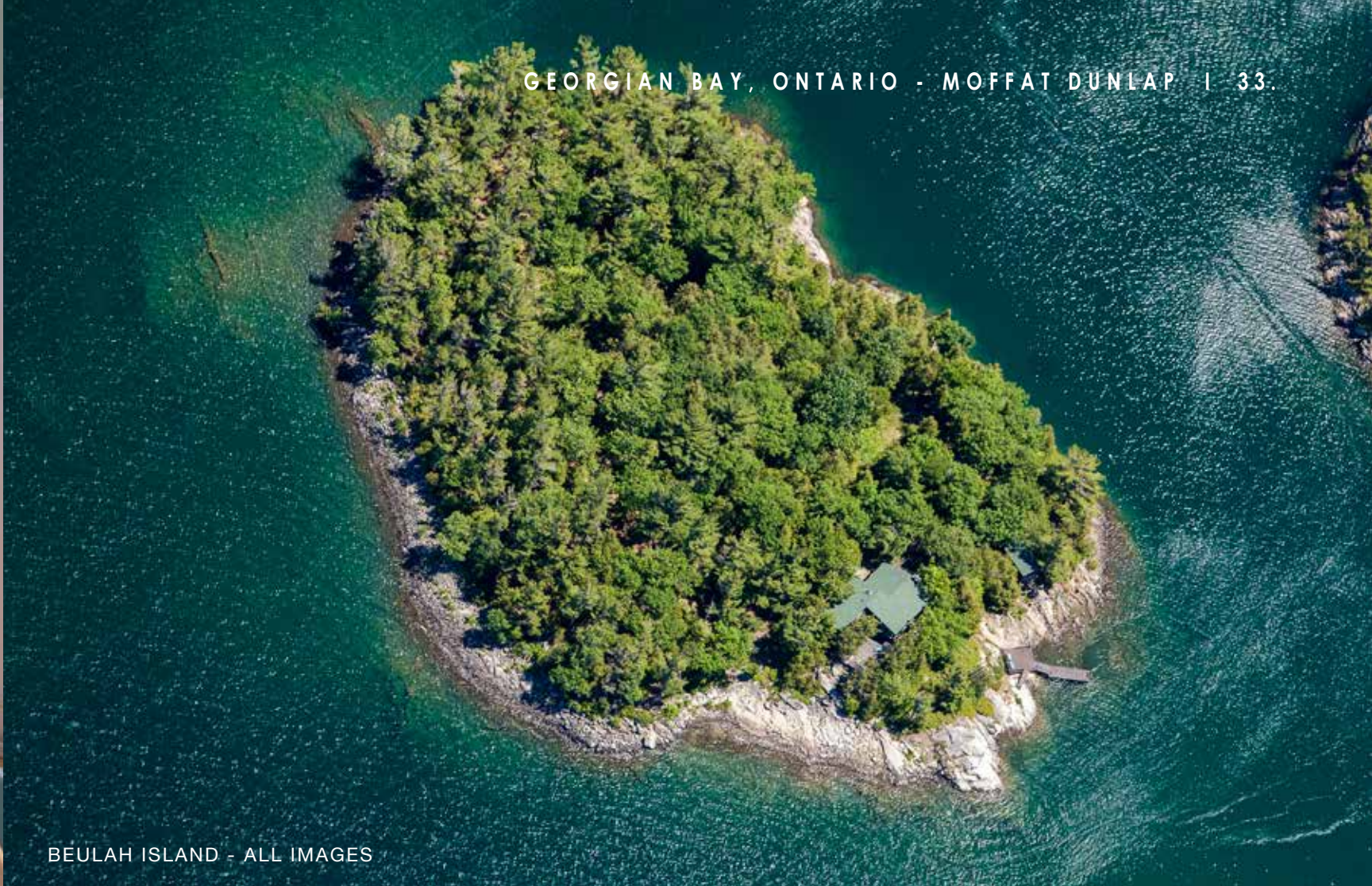
BEULAH ISLAND - ALL IMAGES