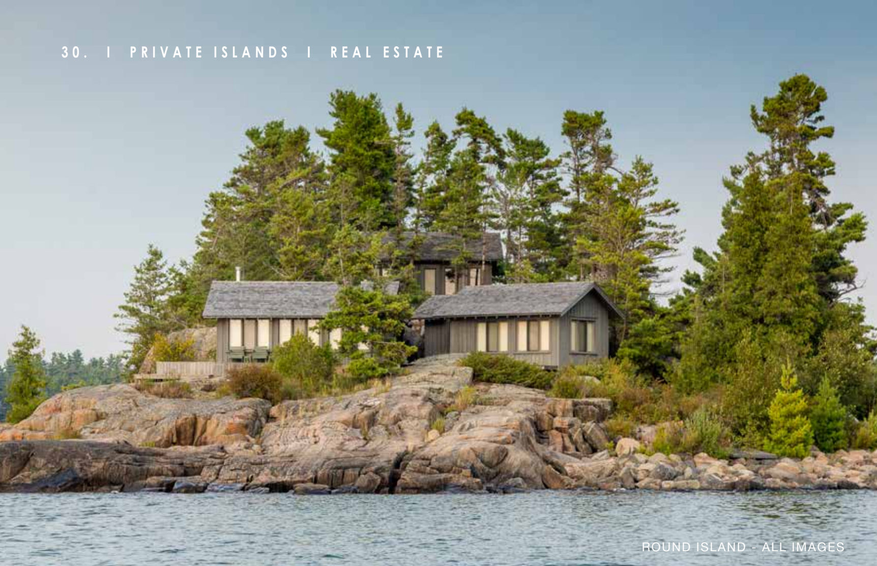
ROUND ISLAND - ALL IMAGES