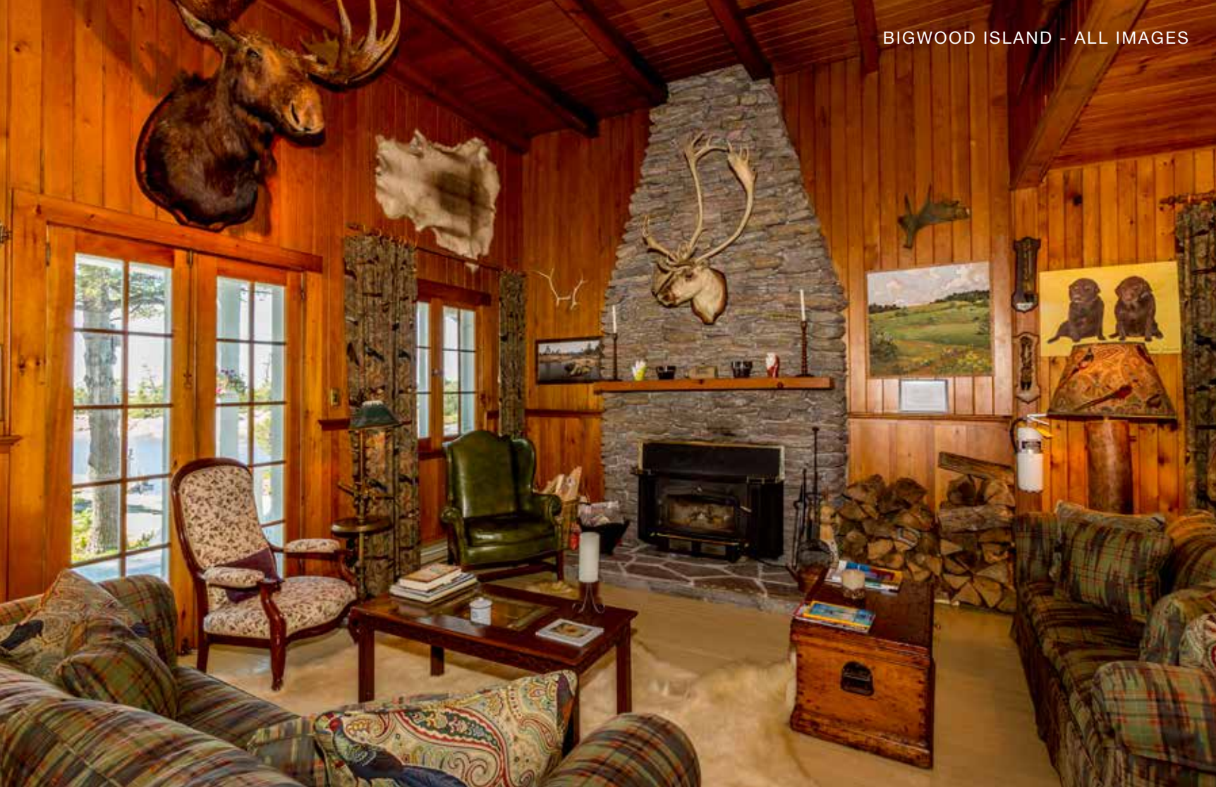
BIGWOOD ISLAND - ALL IMAGES

Covered in white pine forests and smoothly sloping granite – and even featuring a large stone barbeque and picnic tables on its southern tip – Bigwood Island is located about one hour from Toronto by float plane or about three hours by car. Britt Marina lies just 10 minutes away by water.